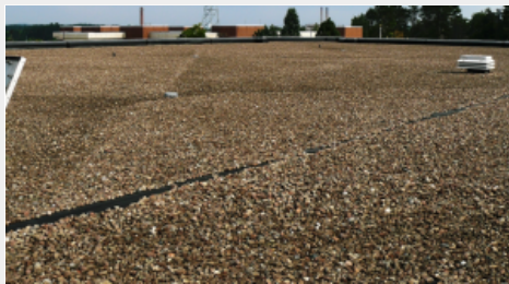
PHOTO 1: This ballasted 45-mil EPDM roof system has been in service for 32 years.

More and more building owners are seeing the light: Roof systems based on historical in situ performance for more than 30 years are the best roof system choice to benefit the environment. EPDM roof membrane has been utilized as a roof cover for more than 40 years, and there are numerous examples of ballasted roofs greater than 30-years old still performing. New seaming technologies, thicker membrane and enhanced design are creating roof systems with projected 50-year service lives. EPDM roof covers' physical characteristics have changed little in 30 years, and because potential for 50-year-plus service life is possible, they are a solid choice of design professionals, building owners and school district representatives who truly desire a roof system that benefits the environment.