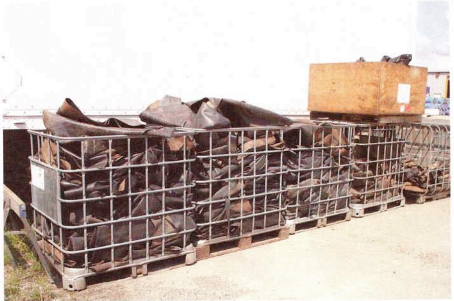
■ Recycling baskets from WDG allow roofing contractors to quickly package EPDM membrane for transport.

Today, that challenge is being met as a result of the partnership between ERA, NFI and WDG. NFI brings more than 20 years of recycling experience to the roofing industry and is North America's largest