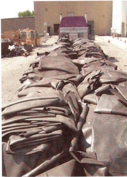
■ Sheets of EPDM membrane are folded and stacked on a flatbed truck from Nationwide Foam.

neutral) disposal costs while increasing environmental benefits. With the additional support of Nationwide Foam Inc. (NFI) and West Development Group (WDG) — the first two members of ERA's Recycling Council — the program made significant progress in 2009 in terms of national scope and cost efficiency.