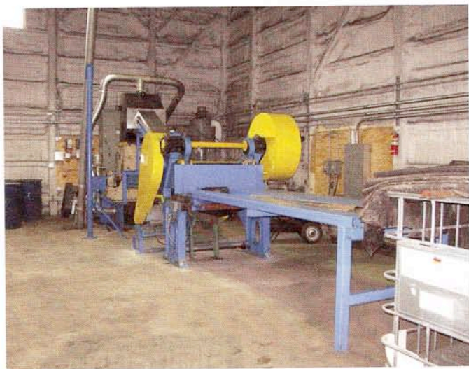
■ At WDG's facility in LaGrange, Ohio, 5-foot by 5-foot sheets of EPDM are sheared and ground into crumb rubber.