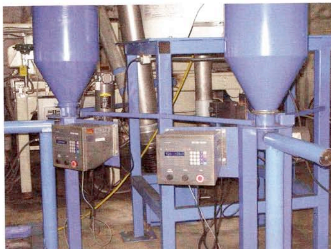
■ WDG grinds approximately 1,200 pounds of EPDM per hour using an environmentally friendly process that produces zero waste and retains all of the physical properties of EPDM.