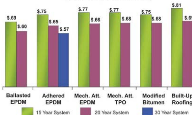
Chart 1: Equivalent Uniform Annual Cost (EUAC) of Roofing Systems